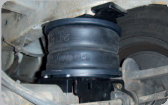
Basic system 1550220100